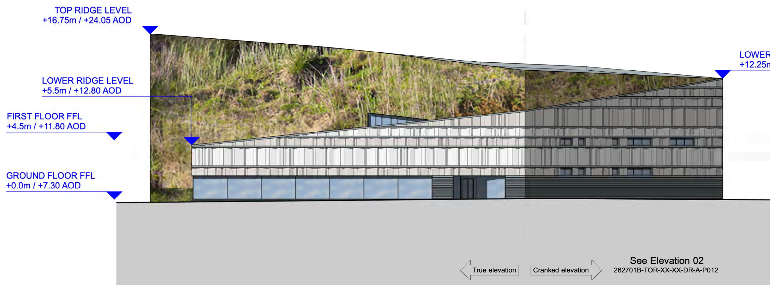
03 Elevation 03 (north-eastern) 1:200 @ A1 / 1:400 @ A3